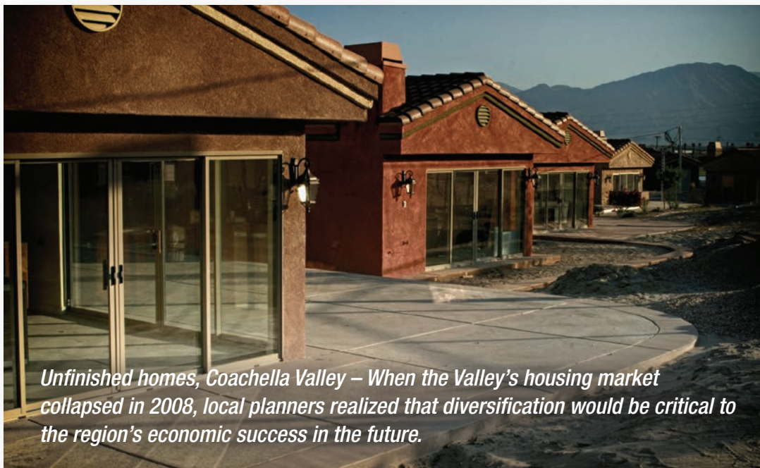
Unfinished homes, Coachella Valley – When the Valley's housing market collapsed in 2008, local planners realized that diversification would be critical to the region's economic success in the future.

"Our work to help companies grow and create high-wage jobs, and support educators in preparing the next generation of workers is vital to the Coachella Valley's success."