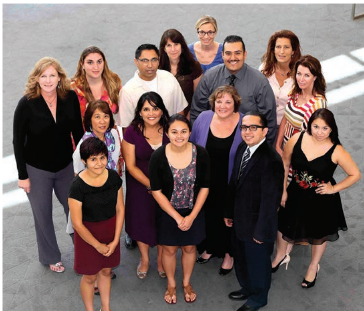
CVEP's workforce excellence team. The need for workers with better skills and education led the organization to take a more comprehensive approach to college and career readiness.

tion attainment among local workers was the major impetus for a more intensive approach. She points to a survey of major companies that indicated 80 percent of their job recruitment was focused on attracting workers outside of the Coachella Valley.